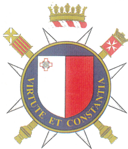
The Chief Herald of Arms of Malta

To all to whom these Presents shall come